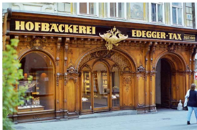
In 1896 the imperial and royal ("k.k.") cabinet maker Anton Irschick crafted the lavish wooden panelling of the Hofbäckerei Edegger-Tax.

From Sporgasse you now turn into Hofgasse where three buildings immediately catch your eye: (i) a shop, designed by the London architect Claudio Silvestrin in the form of a temple; (ii) in contrast, the Hofbäckerei (court bakery) Edegger-Tax with its portal consisting of oak and walnut inlays made in the year 1896 by Anton Irschick , a master court carpenter, and (iii) the house number 10, the also called "Taubenkogel" because of its strange tower with a staircase looking onto the courtyard. This tower was attached to the Jesuit grammar school building when it was adapted in the year 1619. The unique way the façades in Graz were modelled on those of high-Renaissance of Rome is of cultural and historical interest.