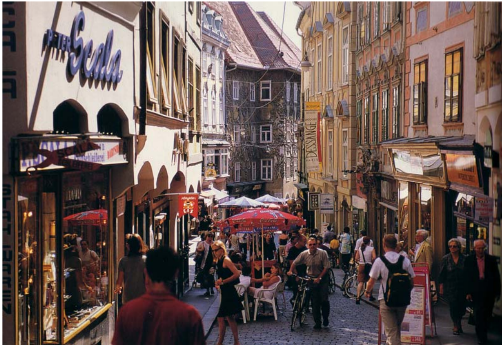
The steeply ascending Sporgasse still follows the medieval course of the street. The lower part of Sporgasse has preserved its typical small bourgeois houses with their high-quality façades.

At the corner house of Sporgasse/Hofgasse are three sandstone coats of arms made from 1691/92. These and the cross of the Teutonic order above the entrance commemorate the fact that the building was owned by the German order of Knights from 1680 to 1939.