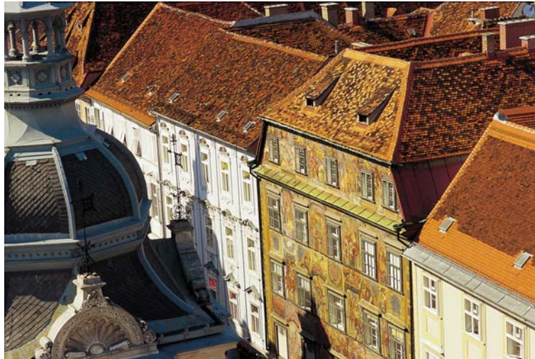
On the façade of the so-called "Painted House" in Herrengasse, the cycle of paintings, dating from 1742, portrays the Gods and heroes of Greek and Roman mythology. The façade, which was painted by the Styrian artist Johann Mayer , is the only one of its kind which has been preserved in Austria.

Towards Hauptplatz a building on the same side of the street, at Herrengasse 3, will immediately catch your eye the so-called Gemaltes Haus (Painted House). It has the only preserved fresco façade of this kind in Austria showing portraits of the Gods and heroes of Greek and Roman mythology. The paintings, which were done 1742 by the Styrian artist Johann Mayer , were restored three times in the 20 th century, as they were already extremely weather-beaten, but their meaning had fallen into oblivion. The figures were deciphered only a few years ago. The building is also called Herzogshof. Before the Habsburg dynasty established their own residence in Graz in the middle of the 15 th century, they carried out their official business as sovereigns of Styria in the Herzogshof. The property manager's task was to set up the "sovereign's chair", and was thus released from paying taxes.