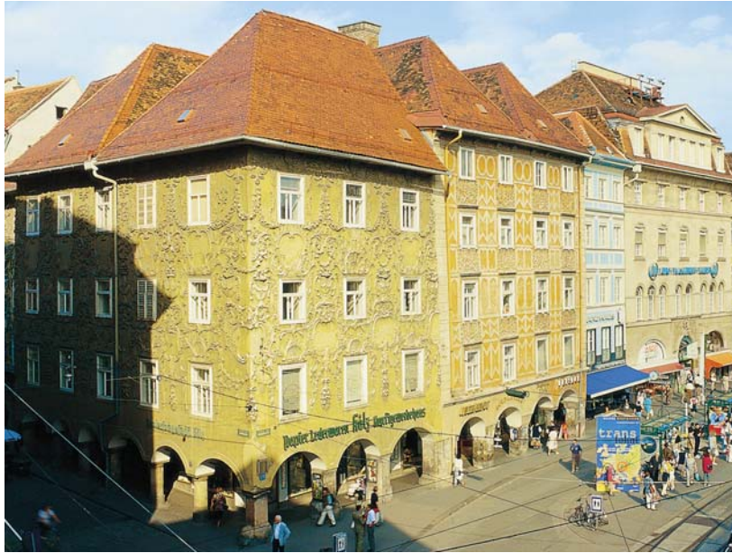
The two Luegg houses (Hauptplatz 11 and 12), with stucco front built around 1660/70.

Walking through the Murgasse and over the Hauptbrücke (main bridge) to the right riverbank while you will reach the Kunsthhaus (Art House). The location of the Kunsthhaus had long been a matter of discussion (according to good old traditions, the municipality of Graz even carried out a public referendum) until the “friendly alien” found its final destination behind the façade of the Eisernes Haus (Iron House). The façade is listed as a historical monument. The Eisernes Haus is one of the earliest cast-iron constructions in Europe (1848).