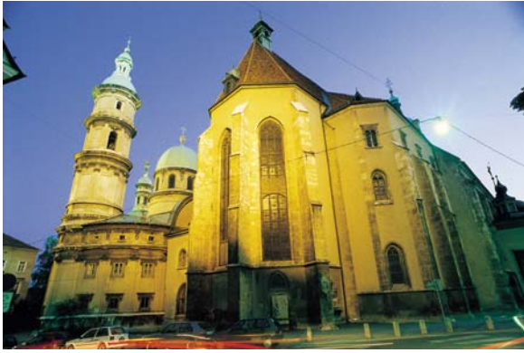
The late Gothic choir of the parish church St. Ägydus, which was built in 1438 and elevated to the rank of a cathedral church of the Diocese Graz-Seckau in 1786.