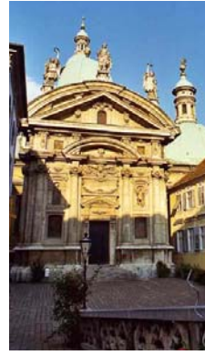
The mausoleum of Emperor Ferdinand II , which was erected by Giovanni Pietro de Pomis starting in 1614, is one of the most important buildings in Austria from the first half of the 17 th century.