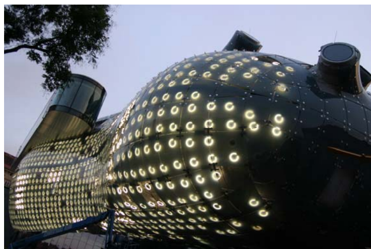
The Kunsthhaus (Art House) designed by the British architects Peter Cook and Colin Fournier represents a new landmark in Graz.

With the Kunsthhaus the British architects Peter Cook and Colin Fournier created a new landmark in Graz, thus creating a new area of architectural tension right in the heart of Graz. Like a huge bubble, the building, which is covered with acrylic glass, hovers over the bank of the river Mur and sucks in light through “nozzles” on the upper side.