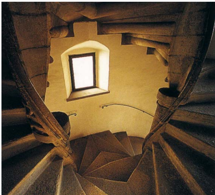
One of the most important late Gothic staircase complexes – the castle's double spiral staircase, built in 1499 under Emperor Maximilian .

Just across the Domkirche is the Burg (castle). In the tower left of the drivethrough, after the first courtyard, you see the Gothic Doppelwendeltreppe (double-spiral staircase) of 1499, which is a masterpiece of the art of stonemasonry at the end of the Gothic epoch. The son of Emperor Friedrich III , namely Maximilian , was responsible for the castle's double spiral staircase. It is a twin spiral staircase, whose both flights of steps, each from an independent spiral staircase, unite on each floor into a common landing. Up to until the second floor, the staircase is draped around a newel, but then continues as a widely suspended stone construction. When the sun shines through the windows the sandstone shines in many colours.