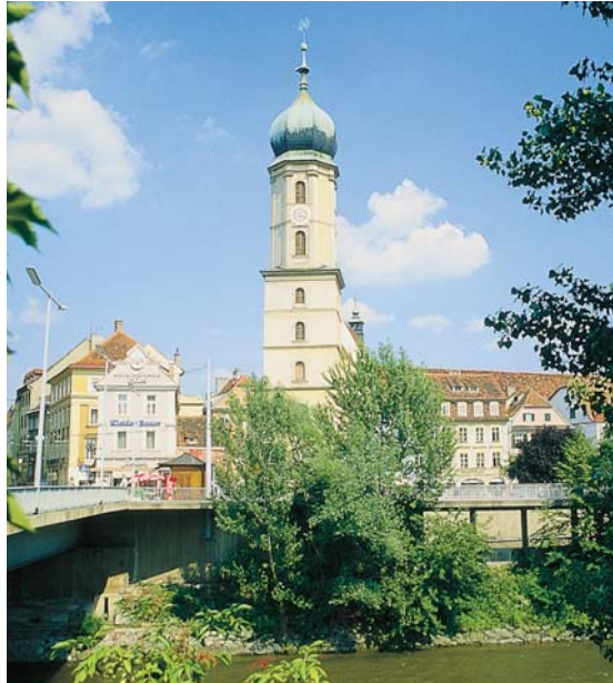
Franziskanerkirche (Franciscan Church), which is one of the parish churches of Graz today.