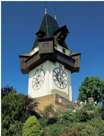
The Uhrturn (clock tower) on the Schlossberg, which is the landmark of Graz.

of the town in 1885. For easy access the Schlossberg funicular was built in 1894 and from 1914 to 1918 the path called Felsensteig was erected with the help of Russian prisoners of war. On the Schlossberg you see the landmark of the town of Graz, the Uhrturn (clock tower). The hands of the clock are reversed. Originally there was only one hand, the big one, which could be clearly seen even from a distance. It showed the hour, and the little hand was applied later. The clockwork mechanism as it is today has struck the hour since 1712. The tower was built from 1559/69 onwards using a fortified medieval tower that was already there. On the Uhrturn there are three bells: one is the oldest in Graz (cast in 1382), a fire bell (1645) and a bell called "Armesünderglocke" (around 1450). When this bell was rung it either indicated an execution or the closing of the city gates, and later, the closing time of inns and pubs.