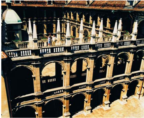
The Landhaus courtyard is one of Austria's most important Renaissance arcade courtyards. The open gallery was built in 1889.