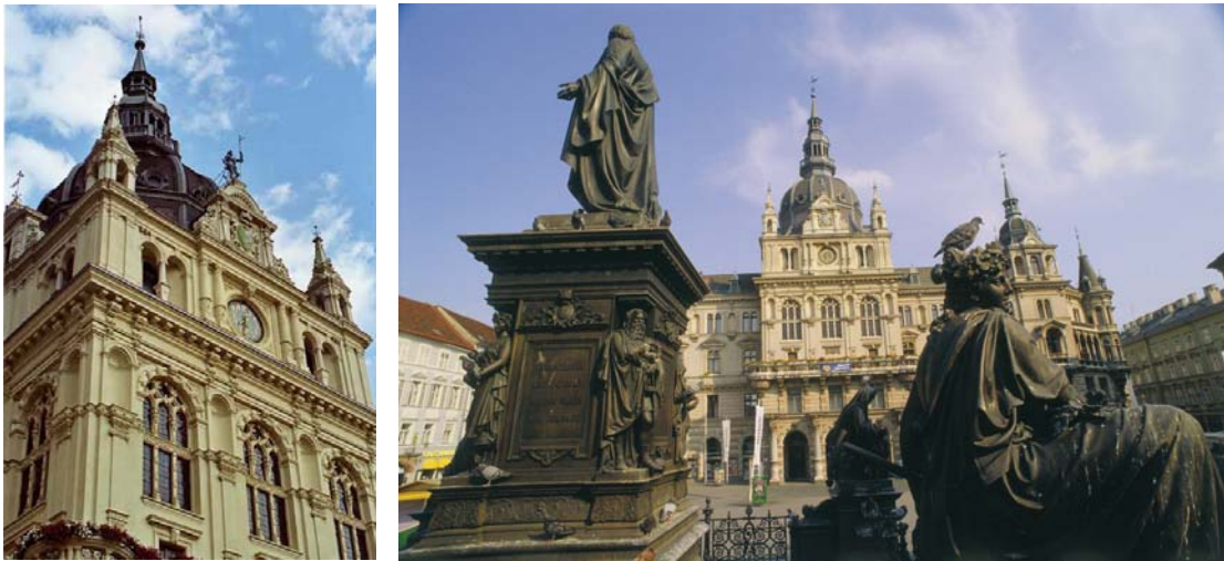
The Rathaus (Town Hall) with the Erzherzog-Johann-Brunnen in front.

The walk starts at the Rathaus (Town Hall) which is located on the south edge of the Hauptplatz (main square) with its numerous market stalls. The place, on which merchants have been selling their goods for centuries, was chosen as a site for the Town Hall in 1550. Today's building origins from 1894 and replaces the smaller classicist town hall. Besides its distinctive cupola-scape, the town hall displays richly structured details on the façades. If you look at the left side of the city hall's entrance, you cannot overlook a Secco painting. This picture shows the history of the city hall in the various epochs. Above the entrance lies the municipal council hall, where the municipal council holds its meetings. The town hall is not only home to the mayor, the city government and the community representatives, it is a registry office as well – so on Saturdays you might come across illustrious wedding parties.