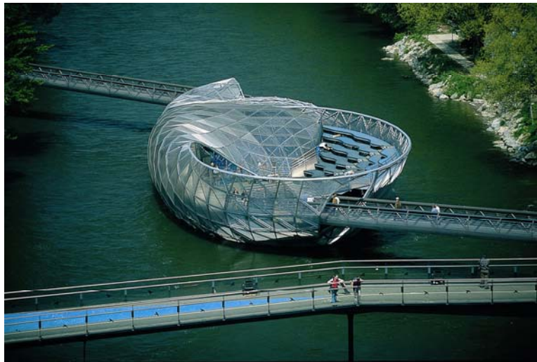
A new landmark in the water is the Murinsel (Island in the Mur) which was erected, according to the plans by New York architect and artist Vito Acconci , on the occasion of the appointment of Graz as the Cultural Capital of Europe 2003.

When you look down to the river Mur you see the Murinsel (Island in the Mur), which was designed by New York architect and artist Vito Acconci : a new fruit growing out of the cultural axis. Go upstream a bit and follow the ramp onto the half open floating shell. The open part of the shell serves as an amphitheatre with room for up to 300 people to enjoy stage performances.