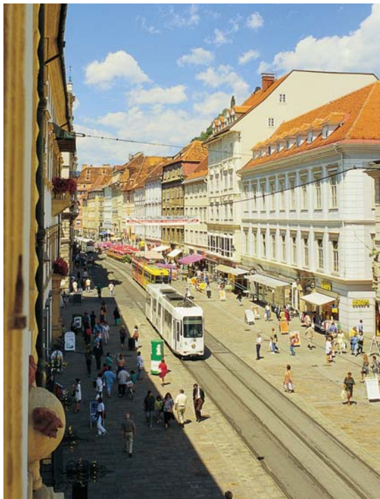
The Herrengasse, which is the most prestigious street in the city centre of Graz.

Landhaus and Zeughaus are facing the Herrengasse , which is the most prestigious street in the city centre of Graz. In the Middle Ages it was only a dead-end street between today's Landhausgasse and Jungferngasse, where the Jewish ghetto began. Today the houses on your way through Herrengasse towards Hauptplatz have some stories to tell. The two monumental houses (one is number 28, the other spans numbers 22 to 26) were built by the busy theatre architects Helmer and Fellner (the architects of the opera house in Graz) in the 1880s. The patron was the Viennese company Thonet, which produced beech furniture. The composer Franz Schubert looks down from a commemorative plaque at the balcony of number 28 (close to the house with number 26). In September 1827, in the previously-existing building Schubert was once the guest of the pianist and advocate's wife, Marie Pachler . At that time her house was an important cultural centre in the city of Graz. In April 1797 Napoleon Bonaparte spent several nights at Herrengasse 13.